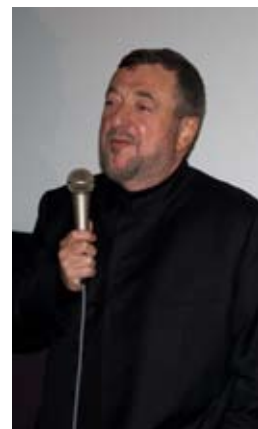
Pavel Lungin, director