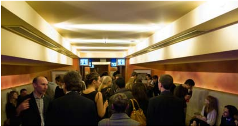
Festival opening Apollo West End