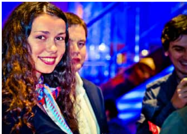
Guests at the Opening Night