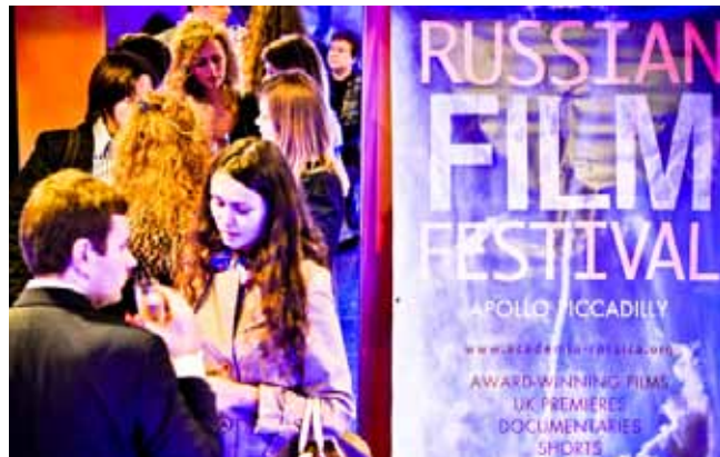
4th Russian Film Festival Opening Night