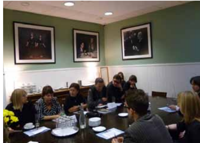
Press conference at BAFTA